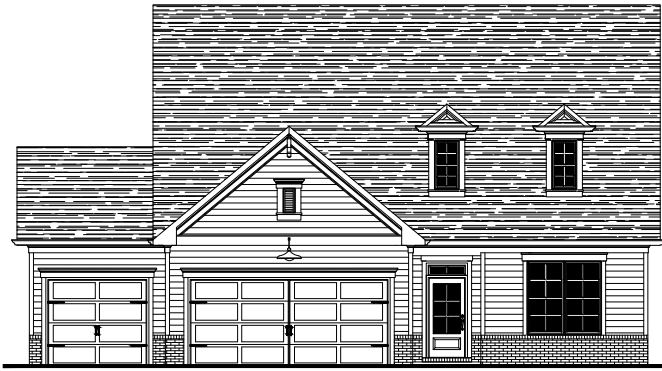
ELEVATION A w/ 3rd CAR GARAGE