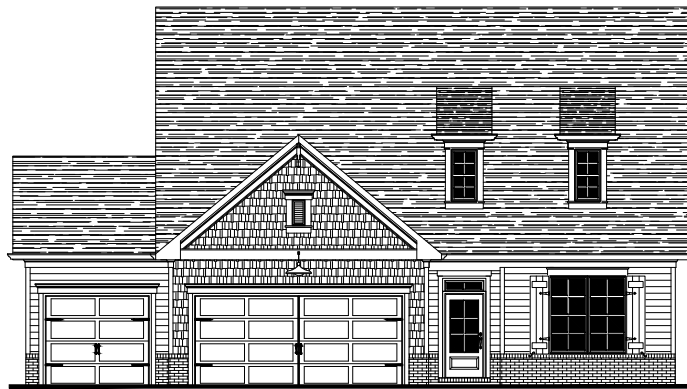
ELEVATION C w/ 3rd CAR GARAGE