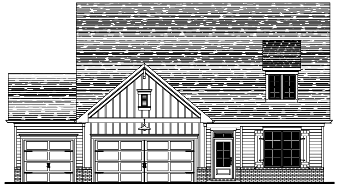
ELEVATION B w/ 3rd CAR GARAGE