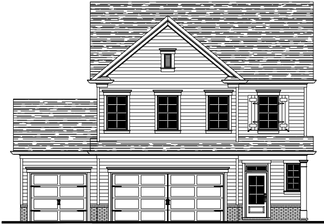
ELEVATION A w/ 3rd CAR GARAGE