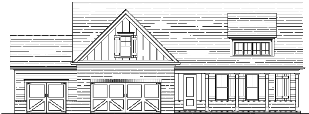
Front Elevation B