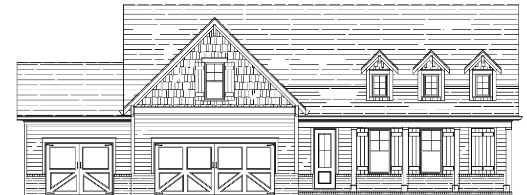
Front Elevation C