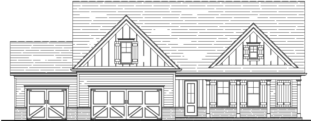
Front Elevation A

3 BR / 2 BATH / 2074 SQ.FT W/ OPT. BONUS & BATH / 2513 SQ.FT